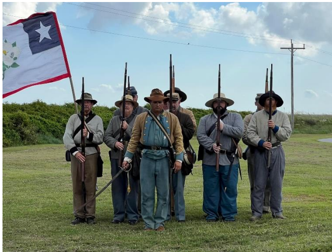
The Shieldsboro Rifles present arms at the flag raising on Saturday August 6, 2022.