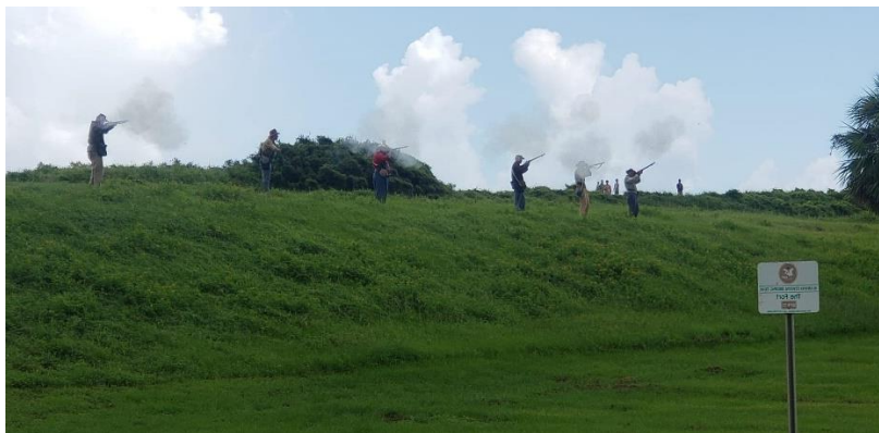
This participants fired on top of the fort at Yankee spies before attacking them.