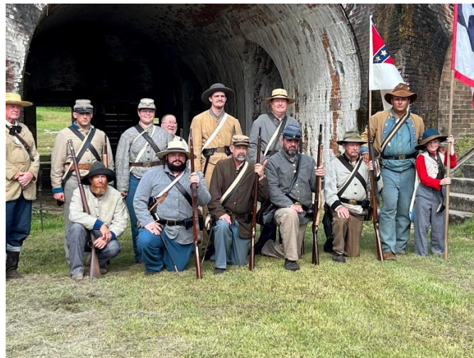
The 3 rd Mississippi Infantry took this photo inside the fort in front of the casemates..