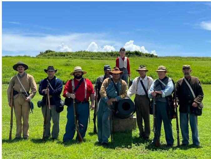
The participants took a photo in front of this cannon out front of Fort Morgan.