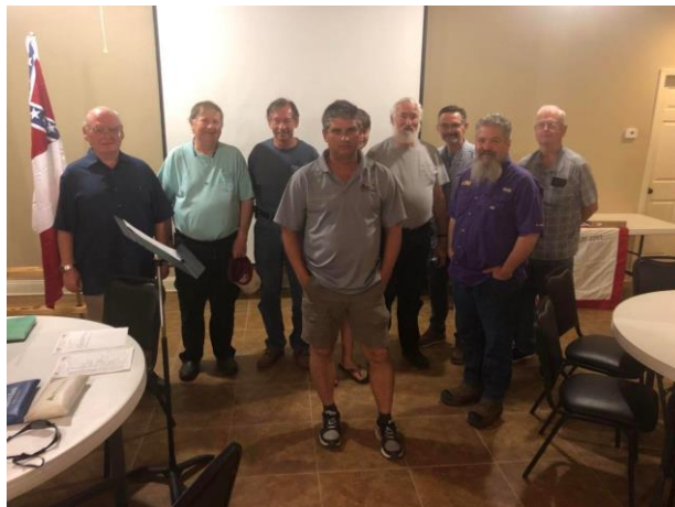
Everyone gathers for a photo after the meeting held July 26, 2022 at the Mercy House.