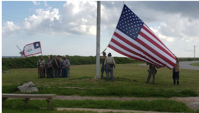
The Shieldsboro Rifles formed up at Fort Morgan to post the National colors.